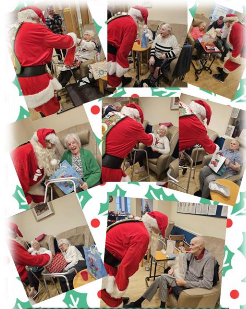
CHRISTMAS DAY & SANTA