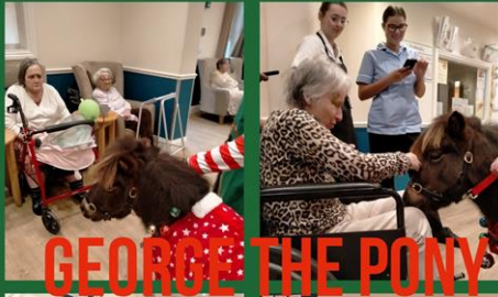
GEORGE THE PONY