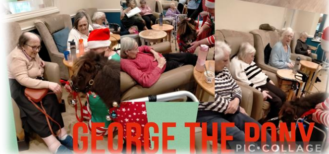
GEORGE THE PONY