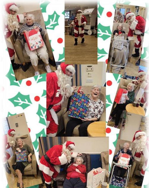
CHRISTMAS DAY & SANTA