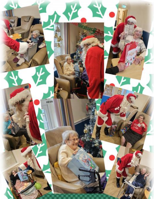
CHRISTMAS DAY & SANTA