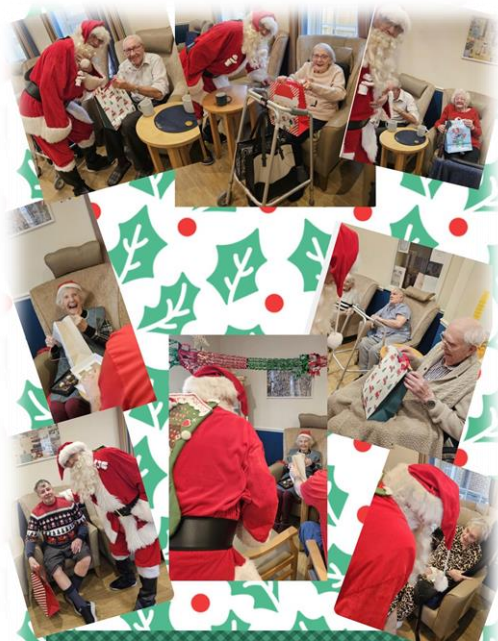
CHRISTMAS DAY & SANTA