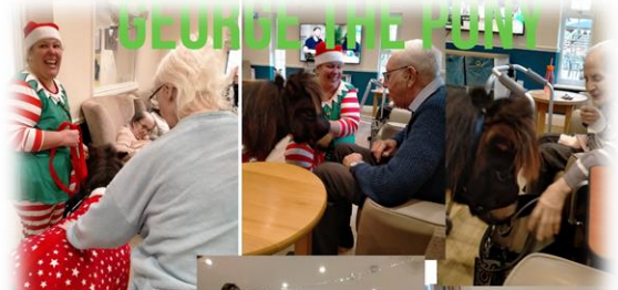
GEORGE THE PONY