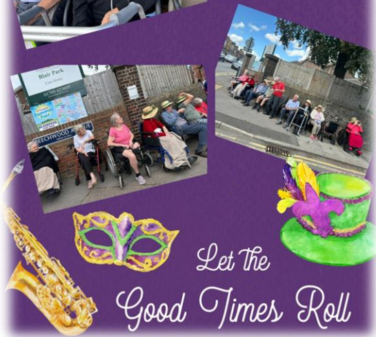
Let the Good Times Roll