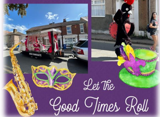
Let the Good Times Roll