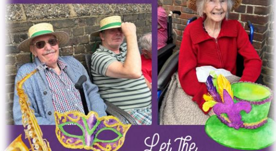
Let the Good Times Roll