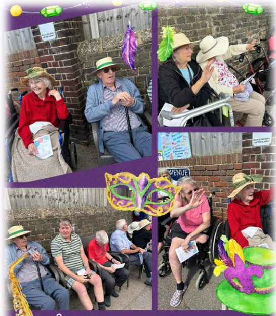
Let the Good Times Roll carnival day 25th August